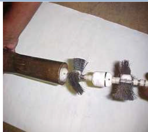
These pictures show the Eagle 2000 Plus Multichannel Probe . These probes are flexible; this allows the bends to be tested with full detection/quantification capabilities.